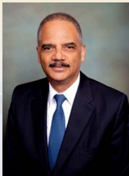
Former Attorney General Eric Holder Keynote Speaker

Eric H. Holder, Jr. was the first African- American to serve as the 82nd Attorney General of the United States. While Attorney General, Holder oversaw the government's efforts to address many critically important issues arising at the intersection of law and public policy. After his departure from the Department of Justice, Holder returned to Covington & Burling and is resident in their Washington office. He focuses on complex litigation and investigatory matters that are international in scope and raise significant enforcement issues and substantial reputational concerns.