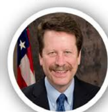
ROBERT M. CALIFF